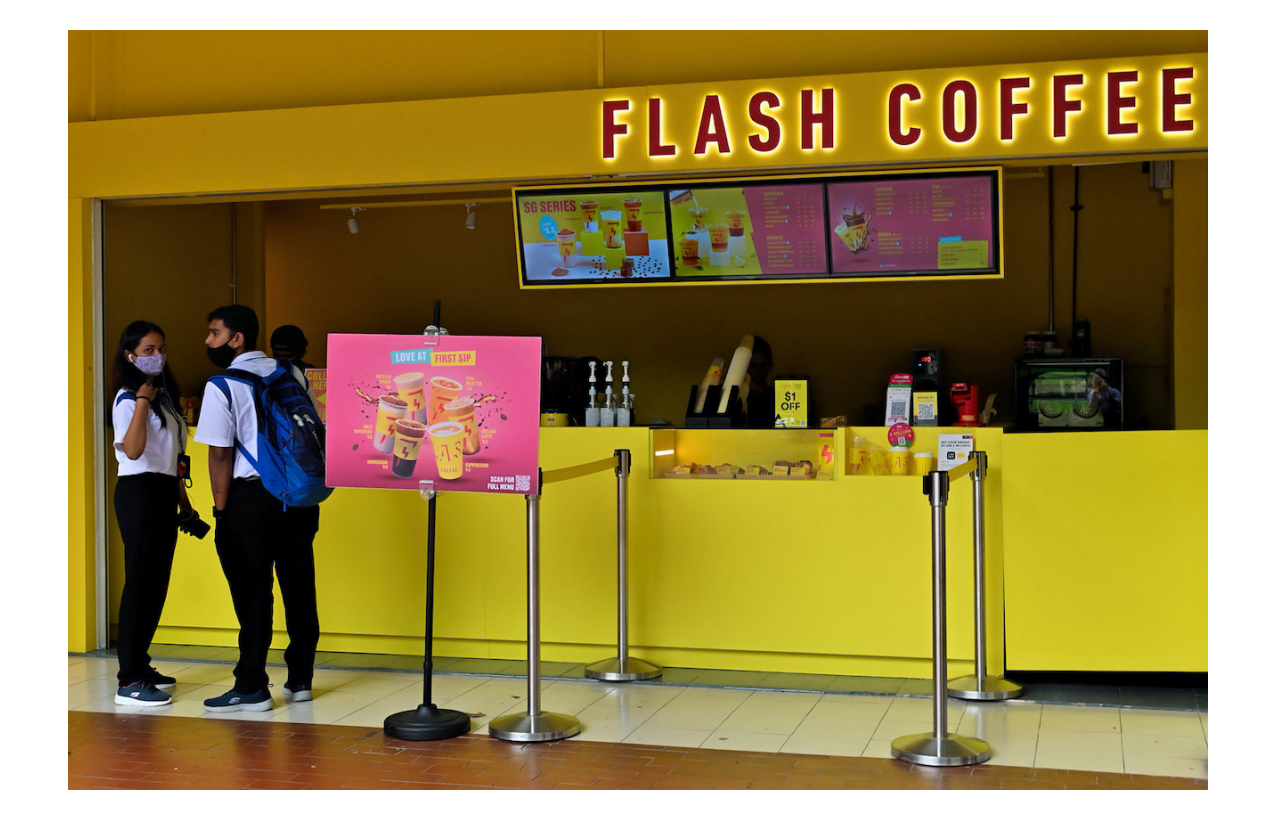
R.I.P. Flash Coffee, we hardly knew ye.

The self-described "tech-enabled coffee chain" has vanished, leaving behind unpaid employees and a bad aftertaste. And that's not beginning to describe actual quality of their product, which our writer describes as having the "flavour profile of soggy cardboard".